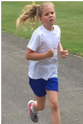
Rosie showing true grit & determination