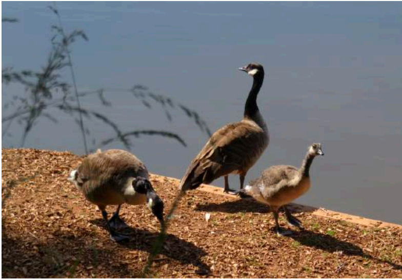
Out with the family – Sunday morning at Campsall Park Lake