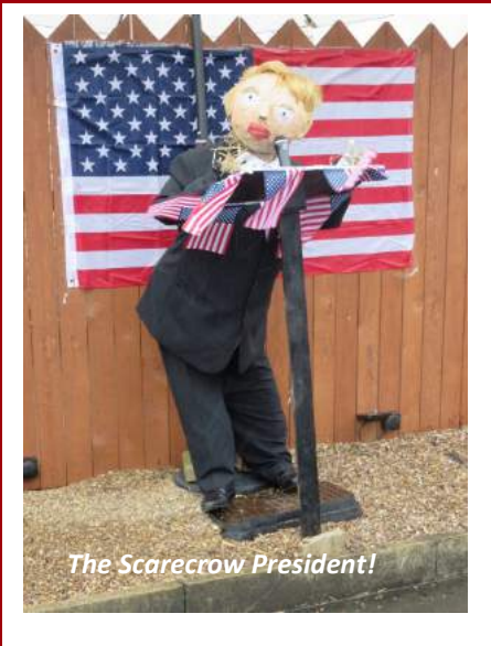
The Scarecrow President!