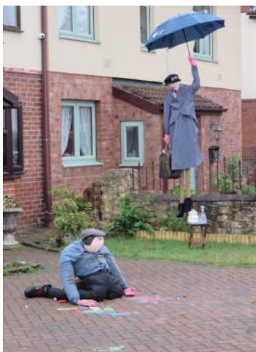
< Mary Poppins