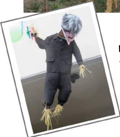
Well Done Everyone - a Great Success!