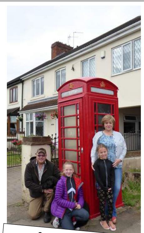
Sutton group give the old 'phone box 'a super facelift > Page 4