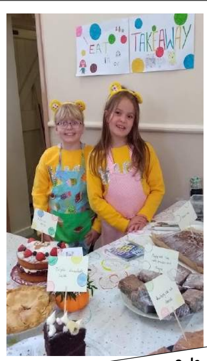
Children's Bake & Cake Sale Raises funds > Page 11