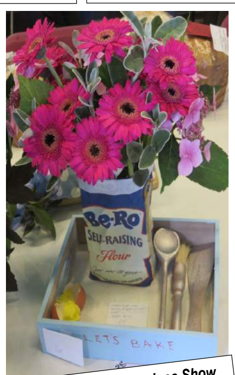
Village Craft & Produce Show - great entries in all categories! > Page 5