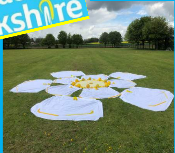
.....the finished product. Welcome to Yorkshire, cyclists!