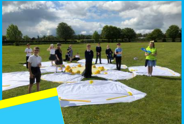
Pupils from Norton Junior School creating the 'Yorkshire Rose' land art installation ..and..