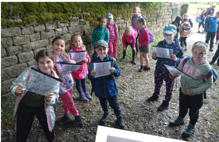
Outward bound With class 4RH