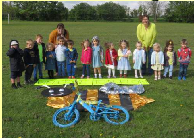
The children and staff of HONEYBEES Pre-School show off their 'Land Art' of a Honeybee on a bike – about to buzz off!