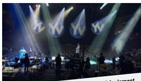
And....we were part of the small matter of the largest children's concert in the world - YOUNG VOICES 2024!

Finally, in Years 5/6, the children are learning about local British history guided by the question: How has the Industrial Revolution influenced lives today? Here, our pupils will make connections to characters who worked in the workhouses to gain understanding and empathy for those who lived through the Industrial Revolution and also look at the development of railways linked to Doncaster.