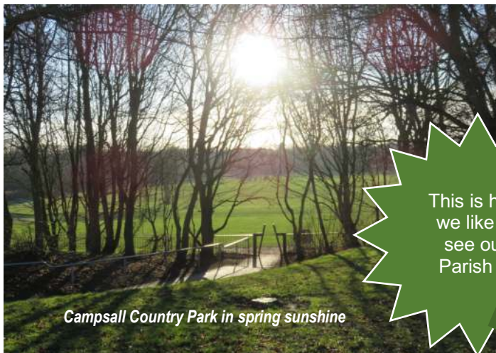
Campsall Country Park in spring sunshine