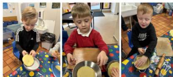
Making Pancakes in the Early Years